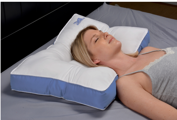
Helps to soothe stiff necks, relieve shoulder aches and comfort the upper body.