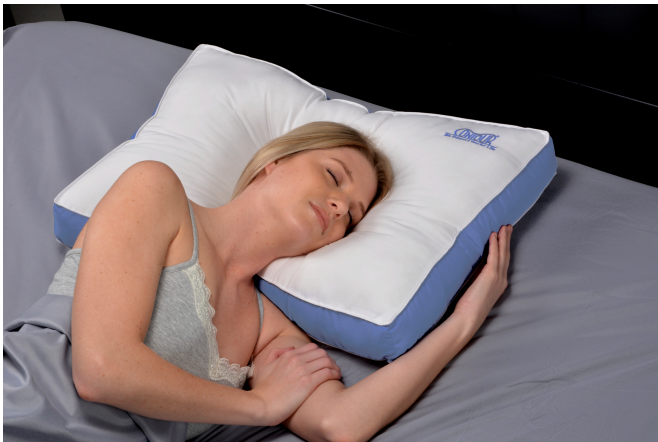
Encourages your neck and shoulder muscles to relax to align your neck and spine.